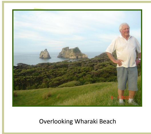
Overlooking Wharaki Beach

On to main base Outpost Lodge at Mangarakau, a wonderful camp, ex schoolhouse, with every facility and 28 beds, good value at $25pp. Extensive swampy areas are the breeding grounds for whitebait surfing the Patarau River. The Whanganui Inlet is a beautiful and spectacular area of towering limestone bluffs, storm battered cliffs, limestone caves and coastal farms. Roads are well formed gravel mostly.