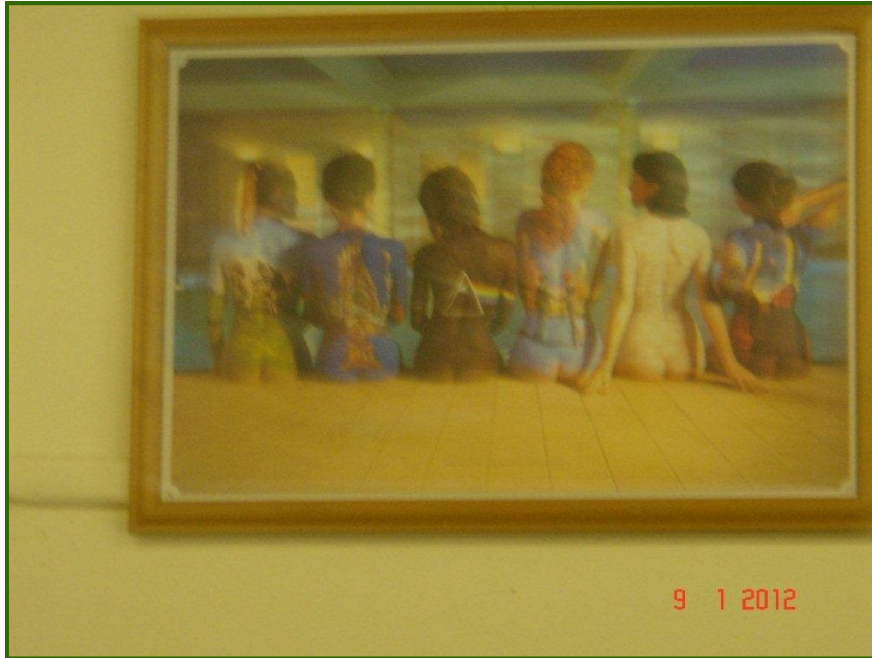
Cheeky artwork at the Outpost Lodge

Austrian ex airline pilot. Several luxury suites and houses. A huge swimming pool blasted from the rock doubles as a firefighting reservoir. We were allowed to drive his well formed track to the Inlet south head – guests usually travel by helicopter to the remote beaches.