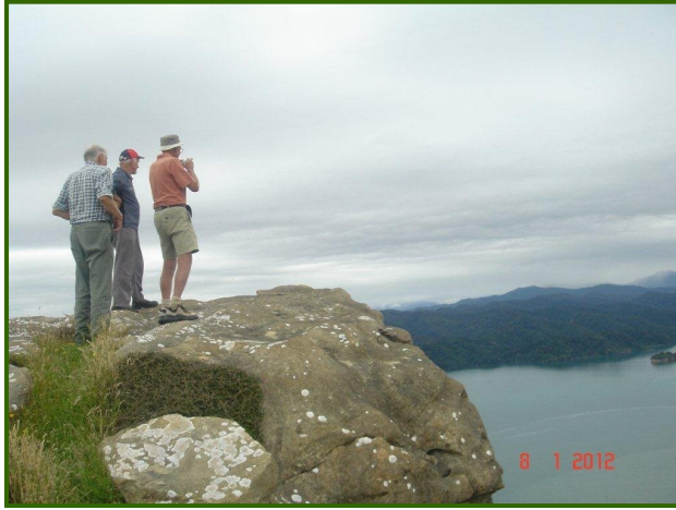
Overlooking Whanganui Inlet

sand balanced on the edge of a steep drop. Our ground anchor was not up to the sand so it was rescue by Alex and a tour of his farm airstrip whence we could see the difficulties ahead. The Anaweka is fordable with care (quicksand) and there have been crossings of the Big River (at the mouth at low tide or well upriver) but clearly unwise for a single vehicle. I would like to go back with a properly equipped team and try again sometime.